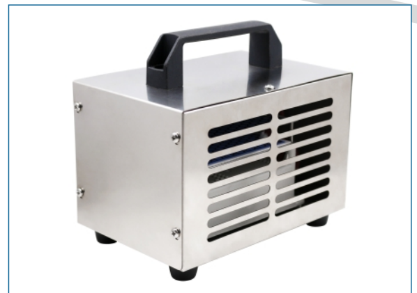
Detalle parte trasera / Back detail

IMPORTANTE: El límite recomendado de exposición de ozono es de 0.1 ppm (0.2mg/m 3 ). Por lo tanto cuando utilice el generador de ozono, utilice siempre el temporizador y no permanezca en la habitación donde se esté generando ozono hasta que no termine de operar. Es muy importante que utilice una buena ventilación.